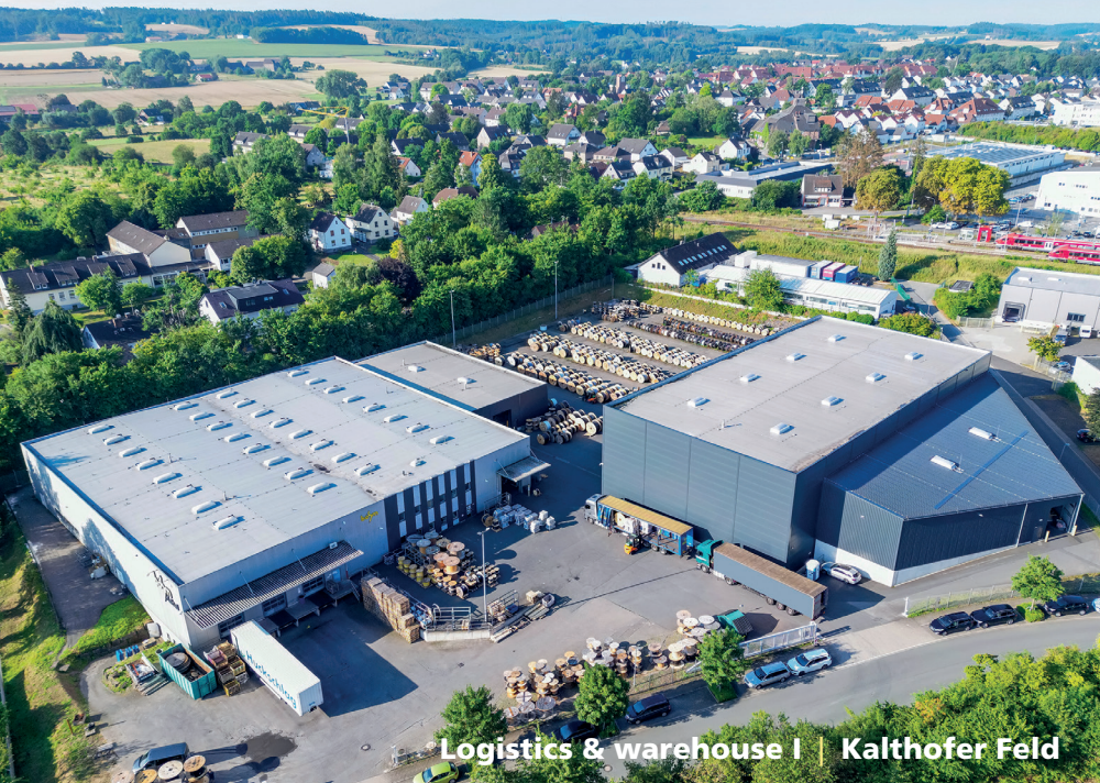
Logistics & warehouse I | Kalthofer Feld