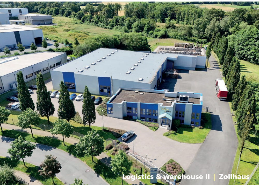
Logistics & warehouse II | Zollhaus